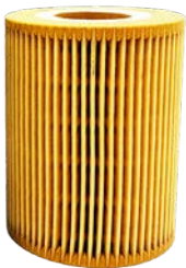
H= 92 mm OD= 31 mm ID1= 72 mm