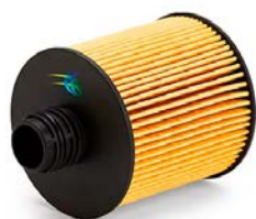
H= 101 mm OD= 72mm ID=18 mm