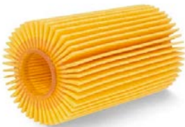
H= 117 mm OD= 69 mm ID=28 mm ID2= 87 mm / 80 mm