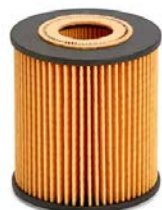
H= 74mm OD= 28mm ID=90 mm / 83 mm