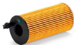
H= 133mm OD= 55mm ID= 67 mm / 60 mm