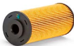
H= 159 mm OD= 66 mm ID1= 17 mm ID2=87 mm / 83 mm