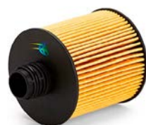
H= 126mm OD= 66mm ID=18 mm ID2=81 mm / 74 mm