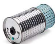
H= 168mm OD= 92mm ID=11 mm ID2=111 mm / 103 mm