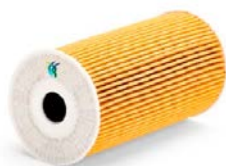
H= 131 mm OD= 65mm ID=19 mm ID2=80 mm / 73 mm