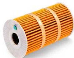
H= 131 mm OD= 65mm ID=19 mm ID2=80 mm / 73 mm