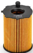
H= 95 mm OD= 66 mm ID=26 mm ID2=26 mm