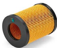
H= 104 mm OD= 84 mm ID1= 43 mm ID2=100 mm / 92 mm