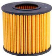
H= 56 mm OD= 60 mm ID1= 28 mm