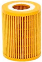
H= 123 mm OD= 64 mm ID= 31 mm