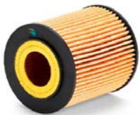
H= 82mm OD=72mm ID1= 87 mm / 80 mm