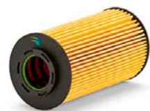
H= 131 mm OD= 65mm ID=19 mm ID2=80 mm / 73 mm